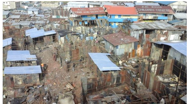
AIC ZION and its environs.