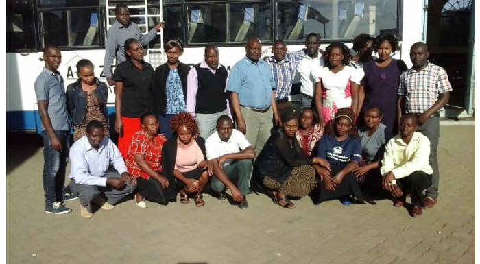
AIC Zion pastor and school staff