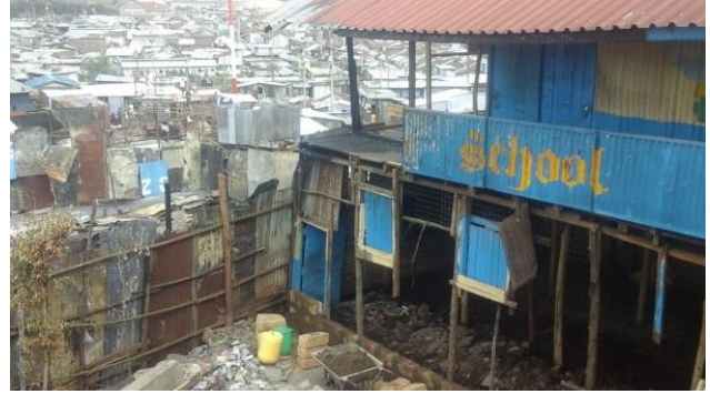
Block B housing classrooms and women's hall on the ground floor. The women hall and one classroom were partly destroyed partly due to fire, theft and rescue operations