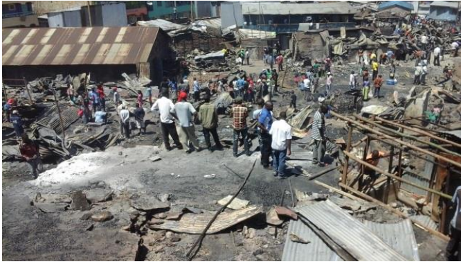
Part of Mathare slum homes burnt down.