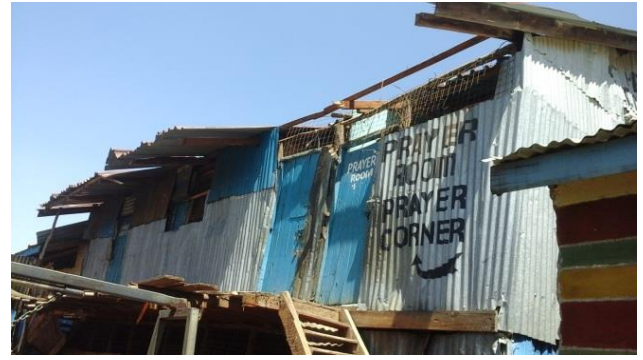
Prayer room on block A destroyed due to theft.