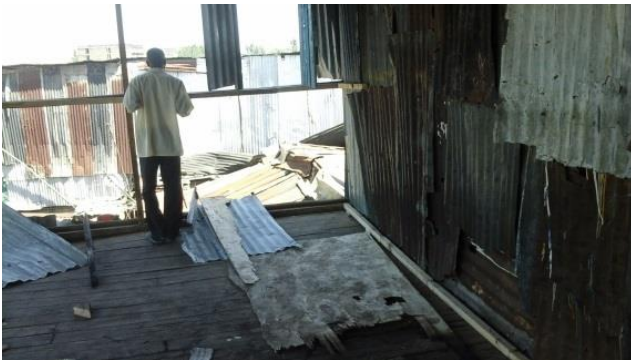
The destroyed classroom.