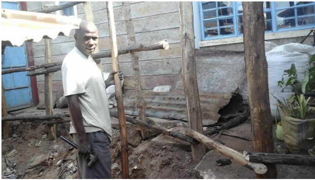
Fencing Repair work