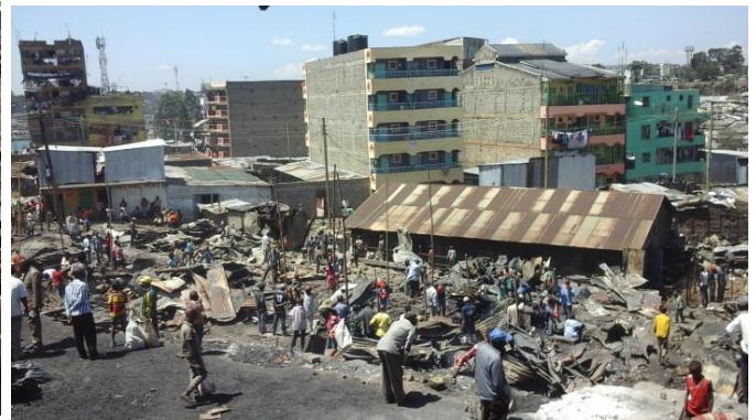
Area adjacent to block C.