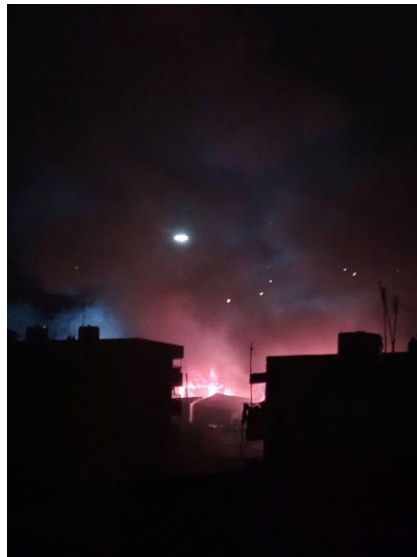
Smartphone picture of the fire

Praise God that He is already beginning to provide. The church immediately launched into rebuilding and repairing because the Kenya academic school year begins in January. Recently AIC Zion reported the following has been done: