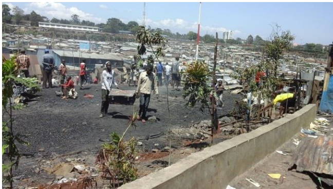
The tree's you planted thankfully still stand. The fence between them and block C was totally burnt down