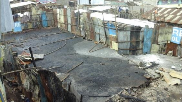
Area where Block C stood. The block housed six classrooms, the Deputy Head Teachers office, the primary school staffroom and the youth hall.