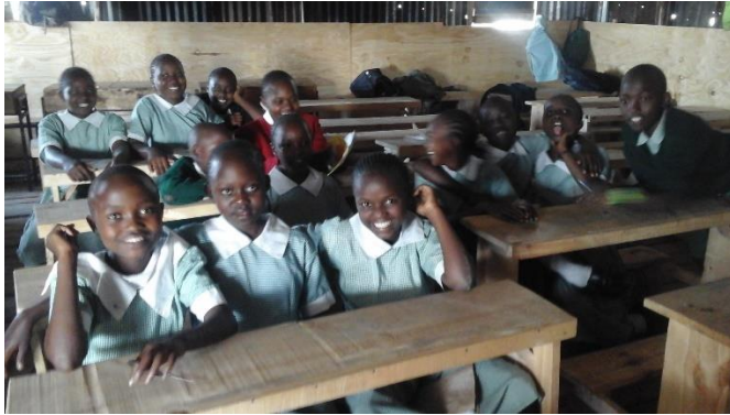
Students with new desks